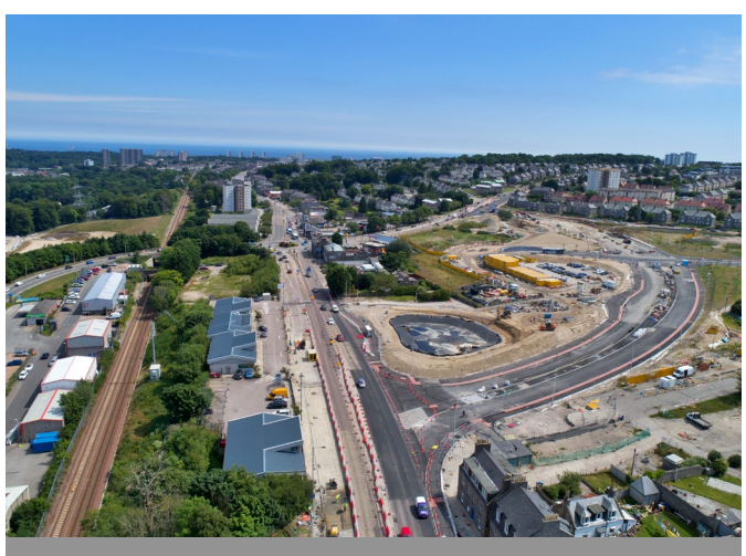
A96 junction work. SuDs detention basin and link roac

The current lane closures on the A96 are helping us to carry out work on the central reservation. We are also installing the pedestrian crossings and traffic signals which will complete the works in this section of the road.