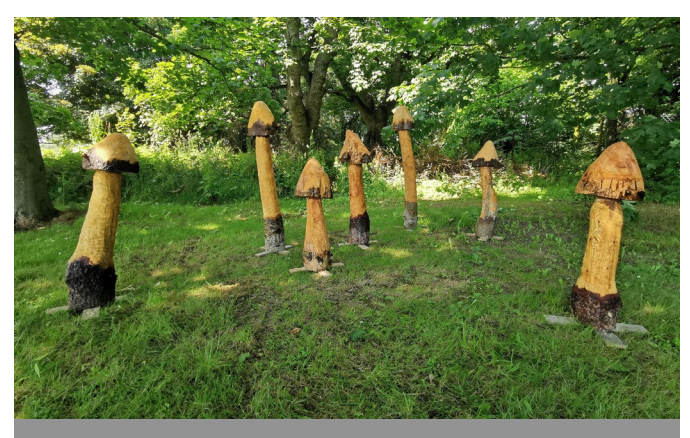
Giant mushrooms sculpted out of recycled wood by youth worker Kane, Jansen

Kane plans to run workshops to inspire and encourage the local community to make their own works of art so they can be enjoyed by everyone on the local woodland walks. We are very pleased to be supporting this great initiative by providing funding and materials. We can't wait to see what masterpieces are produced!