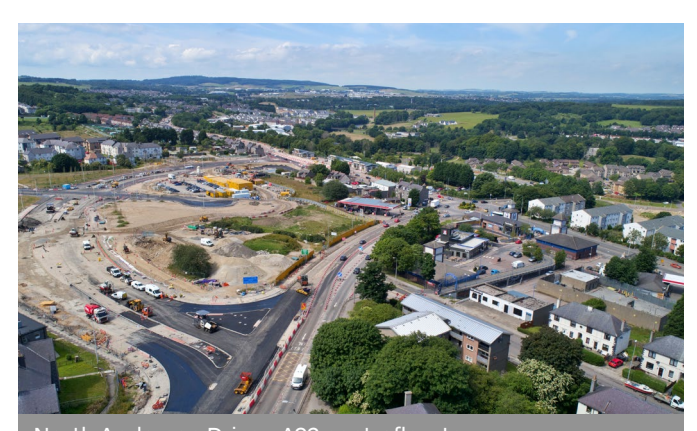
North Anderson Drive - A92 contrafiow to allow junction construction

Despite some challenging excavation work, we continue to make steady progress on the realignment of Manor Avenue with carriageway and footway works. The new bus turning area is also being used and the surrounding footways and stairs are taking shape.