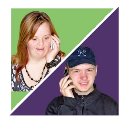
New Action Point 6:

Ally said that they had asked the Aviation Team to meet with MACS but nothing has happened.